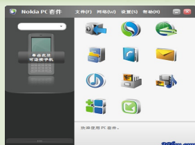
Nokia PC Suite | PPC V7.1.51.0